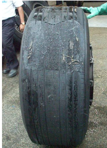
Tyre No. 2