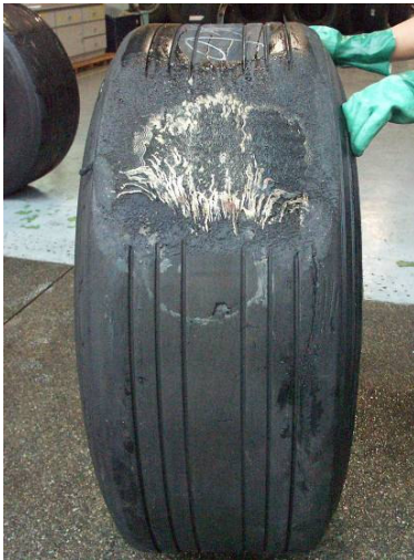
Tyre No. 6