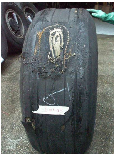
Tyre No. 9