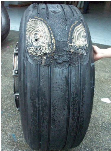
Tyre No. 1