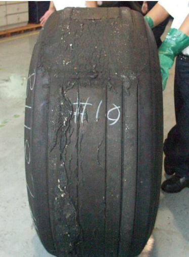
Tyre No. 10