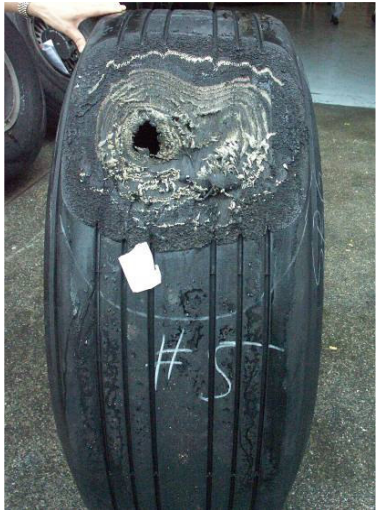
Tyre No. 5