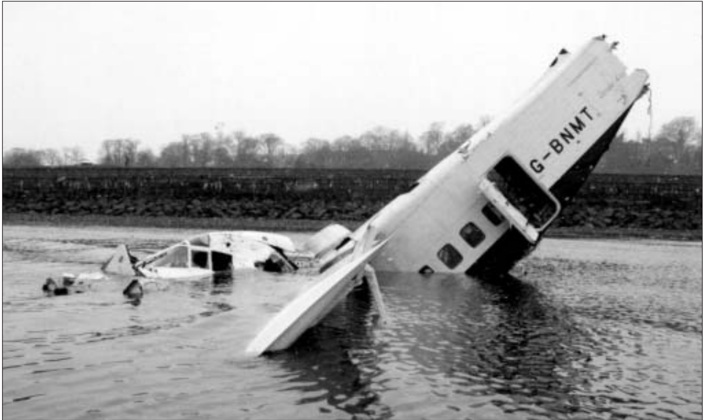
When investigators arrived at the accident site, the tide had receded and the airplane was only partly submerged in seawater.

“After a short delay, the aircraft [was] powered back off stand and taxied to depart from Runway 06,” the report said. “While taxiing, as part of the first-flight-of-the-day engine checks, the crew carried out [a propeller] autofeather test, during which the automatic operation of the engine anti-icing vanes to fully deploy and return was also observed.”