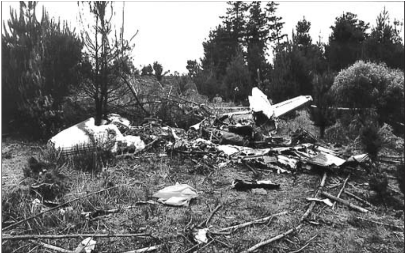
The Raytheon Beech Super King Air 200C struck the ground 3.1 nautical miles (5.7 kilometers) from Runway 18 at the Mount Gambier airport.