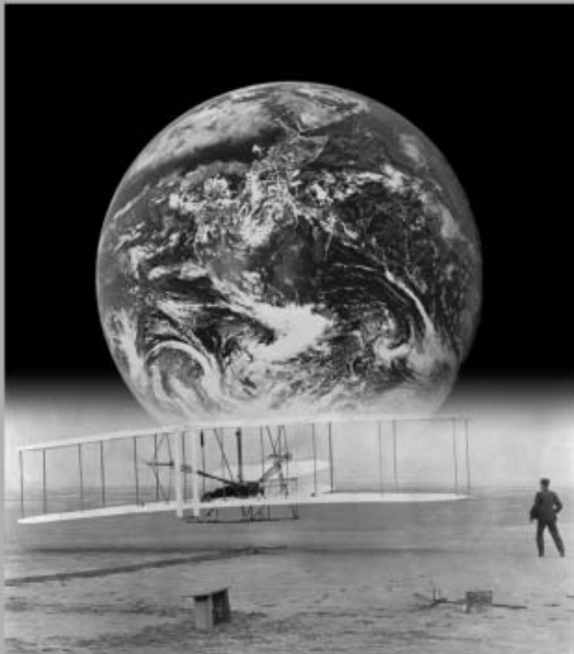
Wright Flyer

Your organization on the FSF membership list and Internet site presents your commitment to safety to the world.