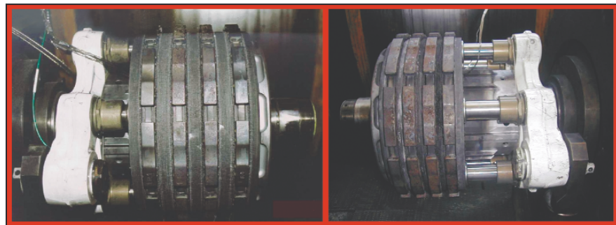
Comparison of new (left) and worn carbon brakes