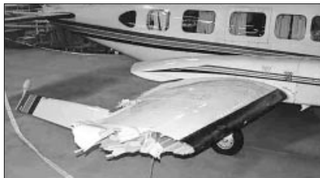
About one meter (three feet) of the Piper Chieftain's right wing separated during the tree strike. The aileron was torn from its hinges but remained attached to the wing by its actuating rod.

The crew remained in Riga and flew the passengers back to Kalmar on the day of the accident.